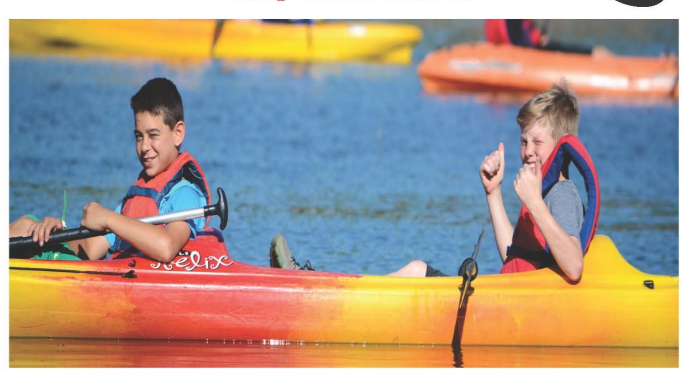
The members of Texas A&M AgriLife will provide equal opportunities in programs and activities, education, and employment to all persons regardless of race, color, sex., religion, national origin, age, disability, genetic information, veteran status, sexual orientation or gender identity and will strive to achieve full and equal employment opportunity throughout Texas A&M AgriLife