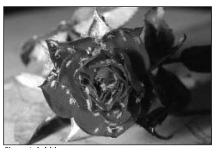
Figure 2. Aphids on a rose.

Aphids: Many species of aphids or plant lice, including the rose aphid, attack roses. Aphids are small, soft-bodied winged or wingless insects about <sup>1</sup>/25 to <sup>1</sup>/8 inch long with relatively long legs and antennae. Species vary in color from black, green, yellow to even pinkish. Some aphids lay eggs; others give birth to live young