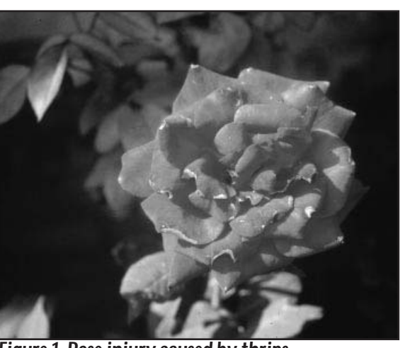
Figure 1. Rose injury caused by thrips.

Correct identification enables growers to choose the best methods to control pests while helping preserve beneficial insects. Not all insects that frequent roses are damaging. Many are incidental; some are pollinators; and others