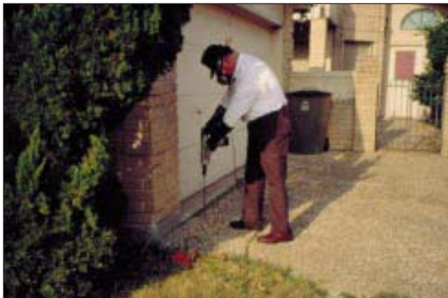
A rotary hammer drill is used to drill holes for the sub-slab method of termite treatment.

Combinations are sometimes used involving all three of the above methods. Sub-slab injection may be used on porches, patios, breezeways, driveways and entryways where separate slabs