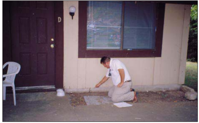
Request a termite inspection from at least three companies.

Consumers shopping for termite control services have more choices than ever before. This is good, but it can also be confusing. Options include baits and soil barriers for subterranean termites, and fumigants and heat for drywood termites.