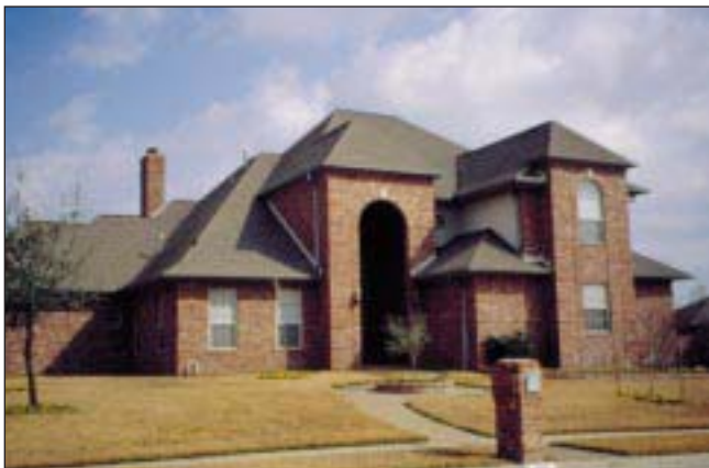
Homes are prime targets for termites.

Do not permit anyone to rush you into buying termite control services. Take the time you need to make an informed decision. Delaying a few weeks makes no difference. There is always time to buy this service wisely and at your convenience.