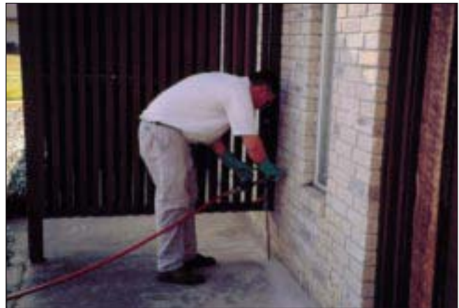
Termiticide is injected in drill holes.

Foam , a relatively new technology, is used to apply termiticide to various construction features of a home. This formulation should be used to treat difficult areas such as chimney bases, dirt-filled porches and certain sub-slab areas. It is not