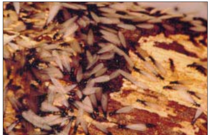
Termites may even begin attacking a home soon after construction.

Wooden structures in Texas have more than a 70 percent chance of being attacked by termites within 10 to 20 years. Termites may even begin attacking soon after construction. Properly treating the soil beneath and around the foundation with termiticidal chemicals before construction, called a pretreatment, reduces the threat of subterranean termites. However, because few areas